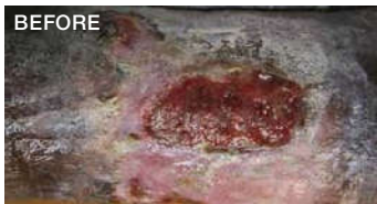
Venous leg ulcer w/hyperkeratotic scales in the periwound area