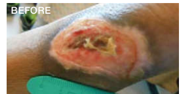
Mixed leg ulcer

Long-term care: Very painful wound. Debrisoft® used for 2 minutes with no complaints of pain .